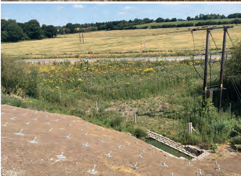
Figure 6.2 Fulscot Road site, two years after planting of 261 m of hedgerow comprised completely of woody species, 975 m 2 of native woodland plants, 335 m 2 of native shrub and 2632 m 2 of wildflower seeding